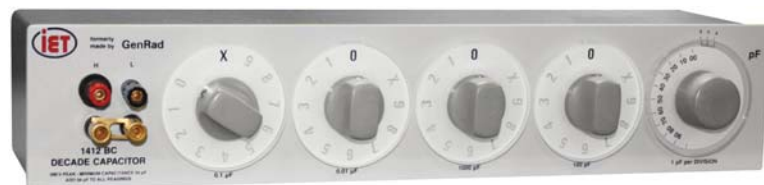
Model 1412-BC Decade Capacitor

The wide capacitance range and high resolution of this decade capacitance box make it exceptionally useful in both laboratory and test shop. Owing to its fine adjustment of capacitance, it is a convenient variable capacitor to use with an impedance comparator. The polystyrene dielectric used in the decade steps is necessary for applications requiring low dielectric absorption and constancy of both capacitance and dissipation factor with frequency.